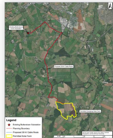
Figure 2 - Underground cable route

Once constructed and operational the only traffic to occur will be for occasional maintenance visits. The impacts of such traffic will be negligible.